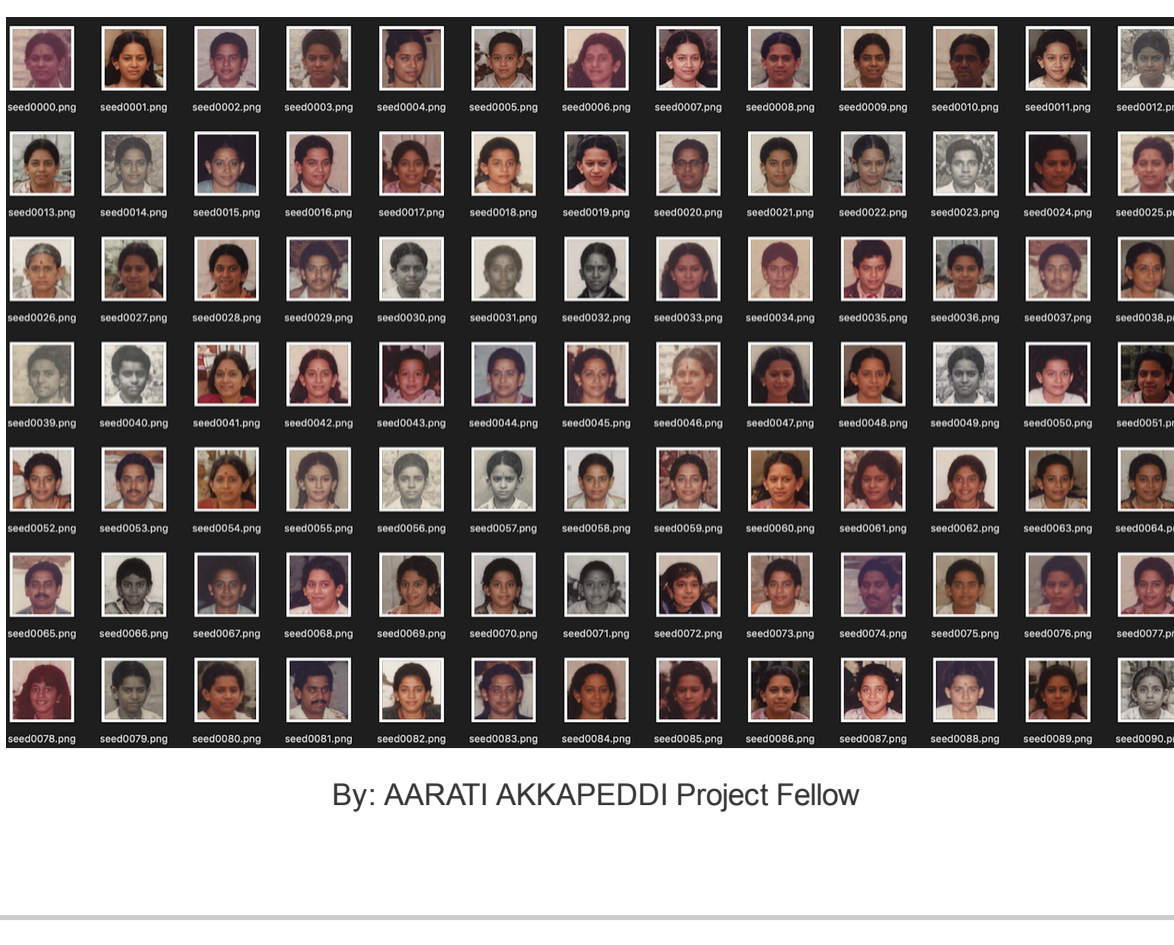
By: AARATI AKKAPEDDI Project Fellow